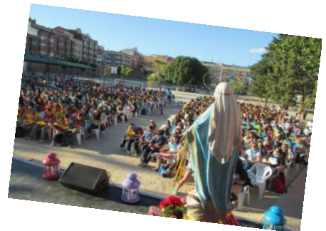
DREAM, SO THAT YOU MIGHT HAVE LIFE VMY SPAIN