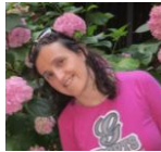
By: Rita Bemposta

International Volunteer VMY Responsible for the Portuguese speaking countries